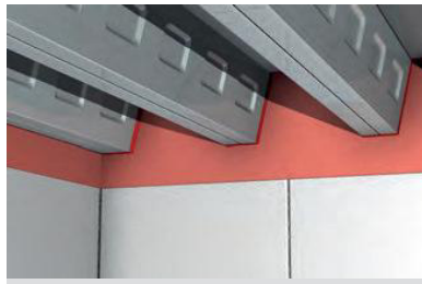
Head of wall application