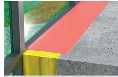
Curtain wall application